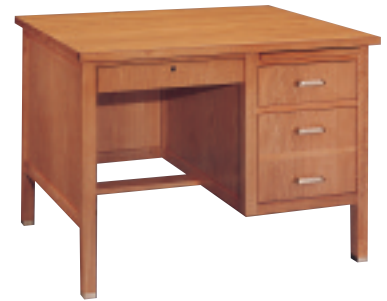
MODEL ST3042RD (SHOWN)