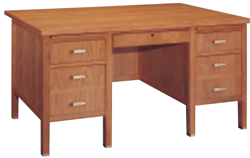
MODEL ST3460DD (SHOWN)