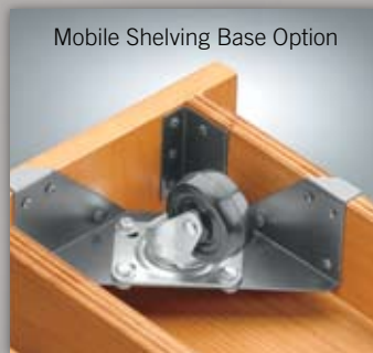
Mobile Shelving Base Option