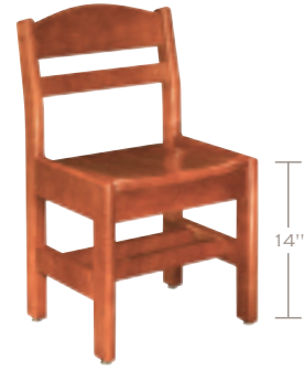
MODEL 54A (SHOWN)