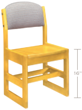
MODEL 57B (SHOWN)