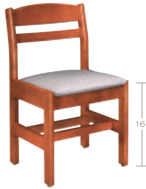
MODEL 56C (SHOWN)