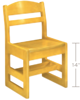
MODEL 55A (SHOWN)