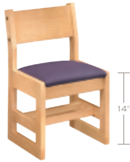
MODEL 15C (SHOWN)