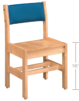
MODEL 16B (SHOWN)