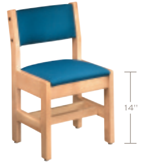
MODEL 14D (SHOWN)