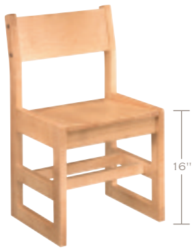
MODEL 17A (SHOWN)