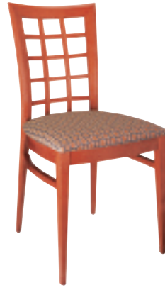
MODEL 4003C (SHOWN)