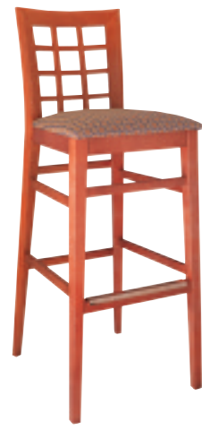
MODEL 4008C (SHOWN)