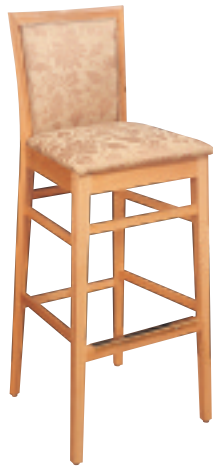
MODEL 4008D (SHOWN)

WOOD SPECIES: BEECH IN 13 FINISHES. SEE PAGE 221.