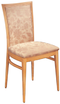
MODEL 4003D (SHOWN)