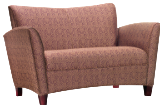
MODEL CB7502W (SHOWN)