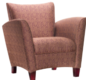
MODEL CB7501W (SHOWN)