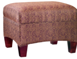
MODEL CB7504W (SHOWN)