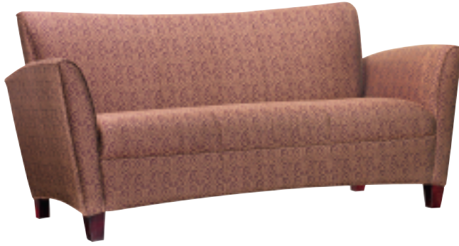
MODEL CB7503W (SHOWN)