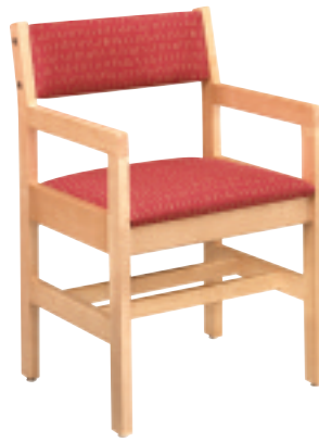
MODEL 11D (SHOWN)