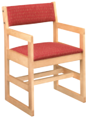
MODEL 12D (SHOWN)