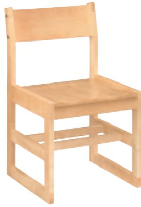
MODEL 19A (SHOWN)