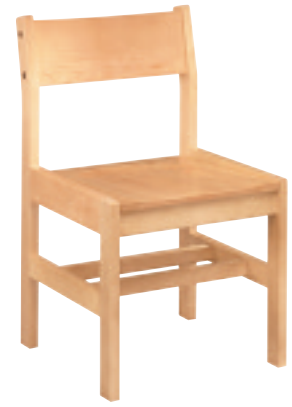
MODEL 18A (SHOWN)