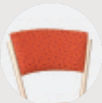
D BACK (FABRIC) $65 UPCHARGE