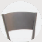
E BACK (METAL) SAME FINISH AS FRAME