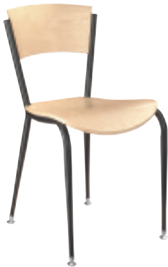
MODEL 283A (SHOWN)