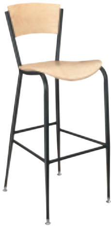
MODEL 288A (SHOWN)

AVAILABLE IN 13 METAL FINISHES. WOOD SEAT SPECIES: BEECH IN 13 FINISHES. SEE PAGE 221.