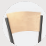
A BACK (WOOD)