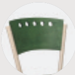
C BACK (WOOD)