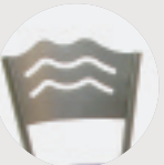
G BACK (METAL) SAME FINISH AS FRAME