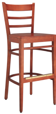
MODEL 468A (SHOWN)

WOOD SPECIES: BEECH IN 13 FINISHES SEE PAGE 221.