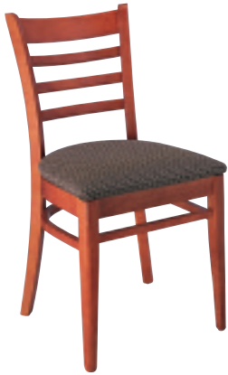
MODEL 463C (SHOWN)