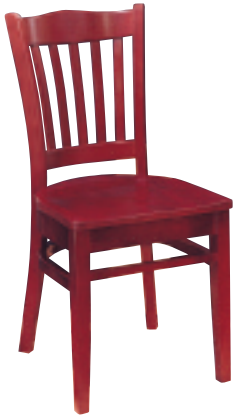
MODEL 483A (SHOWN)