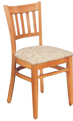
MODEL 473C (SHOWN)