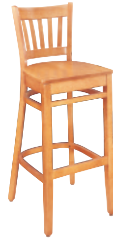
MODEL 478A (SHOWN)