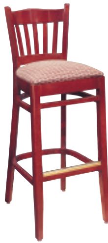
MODEL 488C (SHOWN)

WOOD SPECIES: BEECH IN 13 FINISHES SEE PAGE 221.