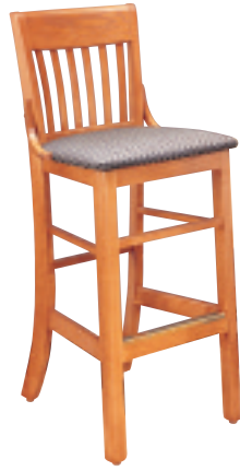
MODEL 307C (SHOWN)