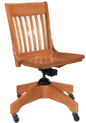
MODEL 302A (SHOWN)