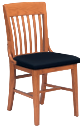
MODEL 303C (SHOWN)

QS QUICK SHIP MODEL 303A AVAILABLE ON 10 DAY QUICKSHIP IN NATURAL OAK ON OAK FINISH ONLY.