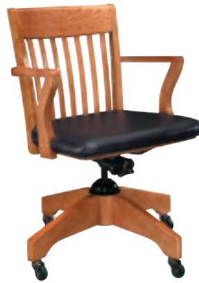
MODEL 300C (SHOWN)