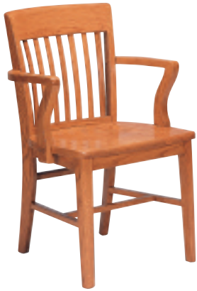
MODEL 301A (SHOWN)