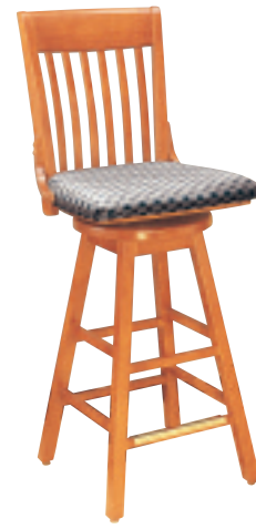
MODEL 319C (SHOWN)