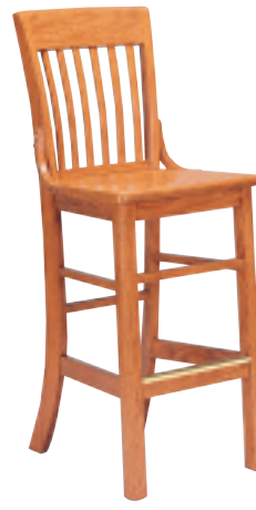
MODEL 308A (SHOWN)